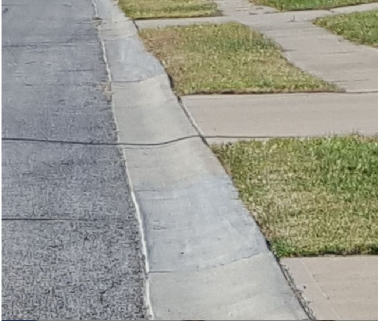
Curbs installed in different years next to each other

In 2016, the City began using a modified high-back curb for retrofit curb rather than the roll back curb for replacement. The new method of curb replacement requires that the curb be removed and replaced either driveway to driveway or all of the curb in front of a driveway. Using the modified high-back curb replacement method results in undamaged curb being removed and replaced. Although this may seem to be an overly aggressive replacement program, larger sections of curb are being replaced between defined points providing for more uniform quality with fewer repeat visits to replace adjoining sections of curb.