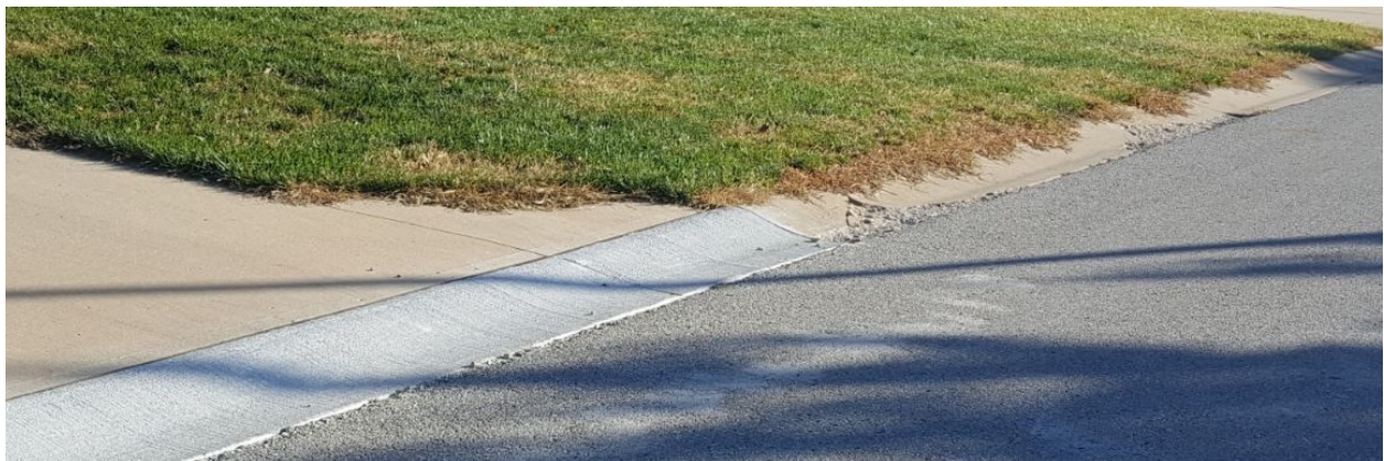
Newer curb in front of driveway with failing curb adjoining it

In previous years, the program called for replacing sections of curb that were rated 2 or 3. This means a street could have small sections replaced and leave a street with other sections of curb remaining. This would result in work occurring multiple times over multiple years to continue to replace small failed sections of curb, eventually leaving a patchwork of replaced curb aging at different rates and with different appearances. An example of this is Derby Street from Preakness Drive to Sunny Lane. All of the curb is now replaced, but none of the sections match in color or appearance.