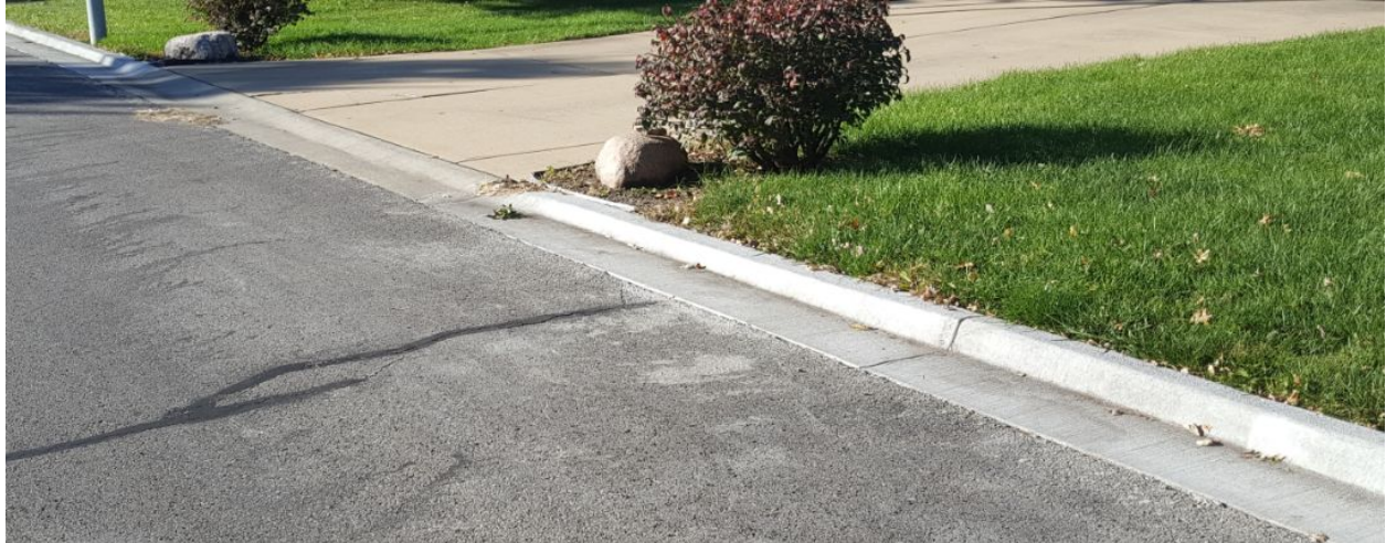
Modified high-back curb with new curb in front of driveway

Under the proposed block by block method, the Engineering Department will review curbs within the three work zones: north City limits to Route 58; Route 58 to Lucy Webb; and south of Lucy Webb (see attached map). The City will work in each zone proportionally by the amount of work that needs to be completed in each zone. This means as one zone has more curb to be replaced than another, it will receive more funding. Each street will be assessed based on the total amount of work that needs to be completed. Final selections will be made based on total street conditions.