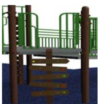
Trail Climber $4,500