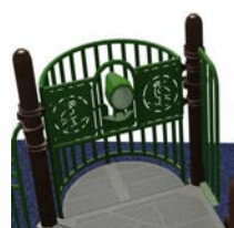
Telescope Panel $4,000