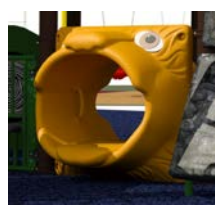
Animal Crawl Tunnel $2,500