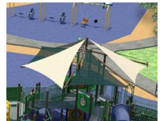
Shade 5-12 Section $18,000