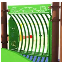
Monkey Lookout $5,000