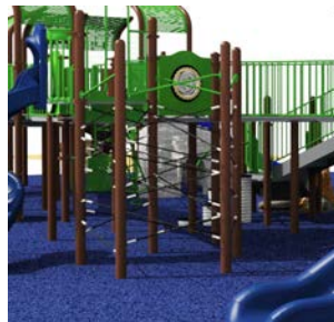
Rope Climber $12,500