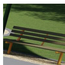
Benches (5) $1,500 each

"PLAYGROUNDS MAKE ME FEEL POWERFUL." Brendan, Age 10