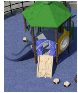
2-5 Section $45,000

Your generous support will enable ALL children and caregivers of all abilities the opportunity to experience the joys and benefits of play. This destination playground will truly impact 10,000 people each year.