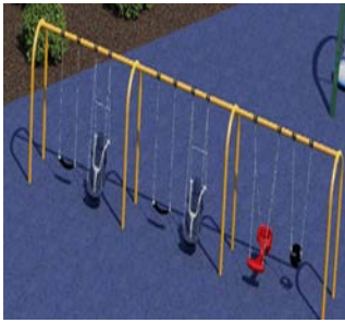
Swing Set $25,000