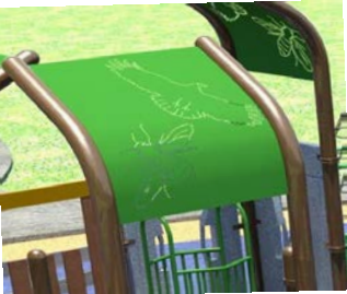
Wildlife Roofs $12,000