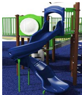
Spiral Slide $15,000