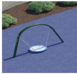
Dish Swing $20,000