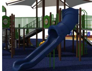
Morphus Slide $10,000