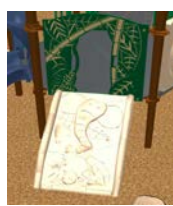
Jungle Climb $3,500