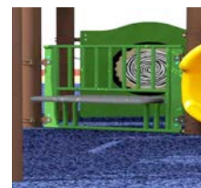
Double Seat $3,000