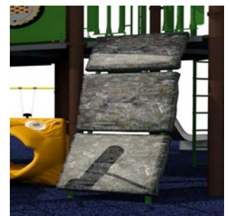
Rock Climbing $12,500