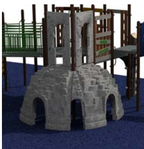
Tikes Peak $15,000