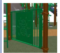
Ladybug Panel $2,500