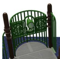
Telescope Panel $4,000