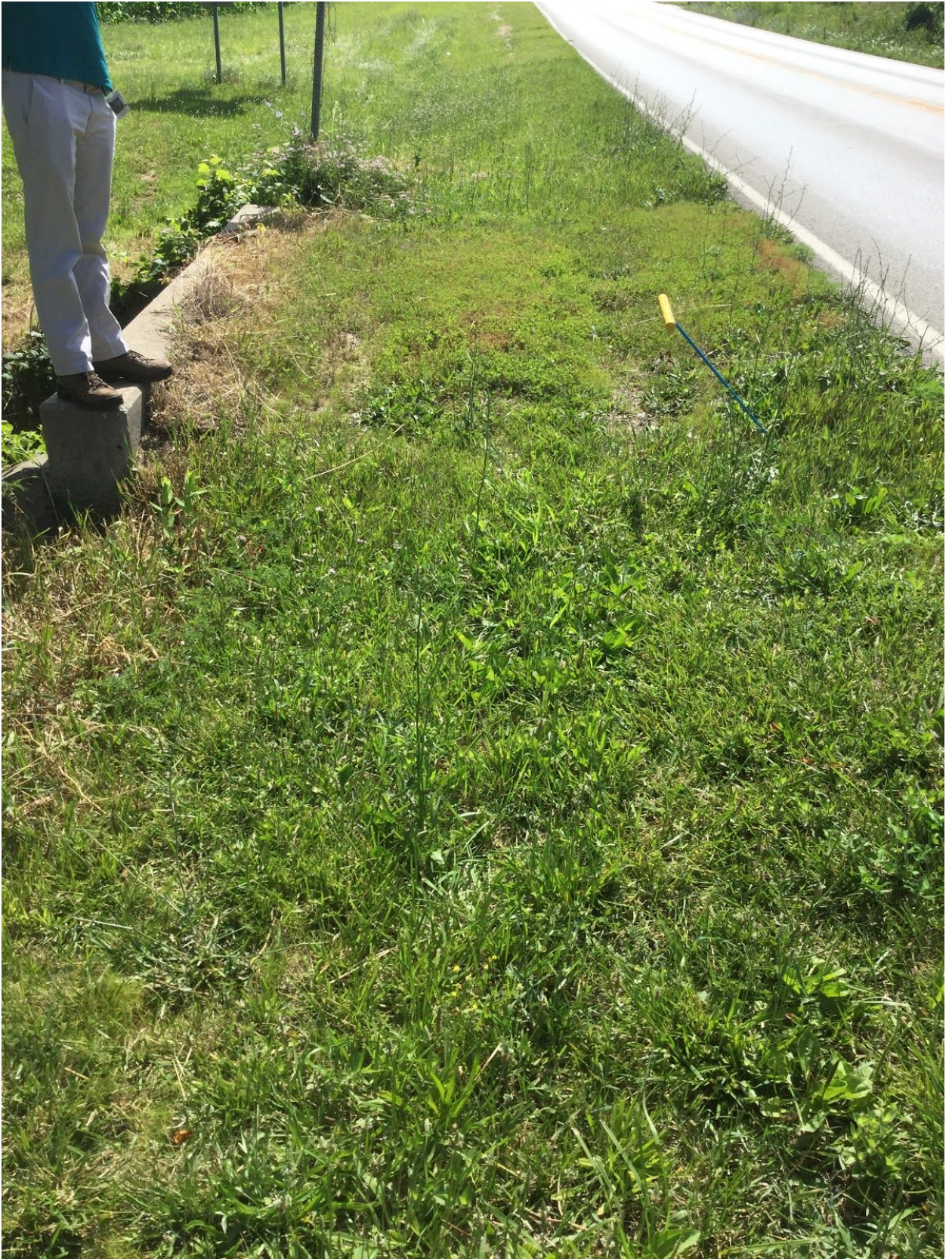
Headwall Repair - Photo #1