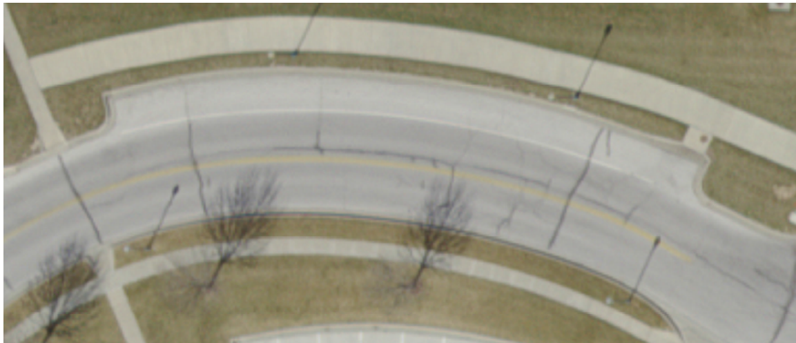
(aerial photograph of parking area along north side of Municipal Circle)