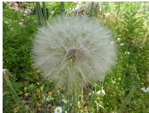
Salsify seedhead