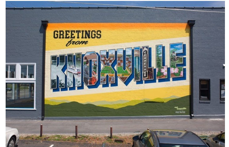
6 Images through 9 Letters