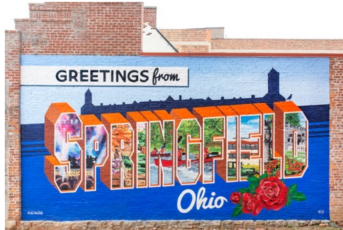
5 Images through 11 Letters *Skyline/Rose counted as +1 Image