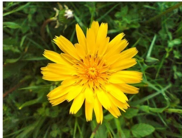
Meadow Salsify ( Tragopogon pratensis )