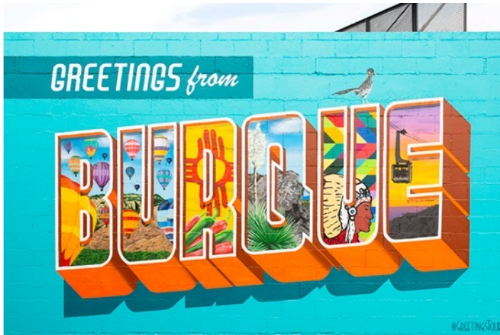
5 Images through 6 Letters