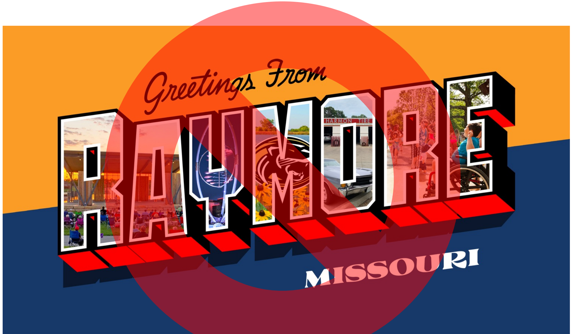
Bringing back orange in background