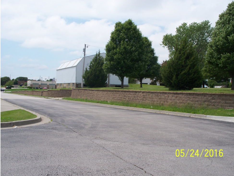
View from Lowe's parking lot looking northwest at site