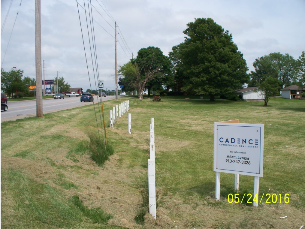
View from Dean Avenue & 58 Highway intersection looking east along 58 Highway