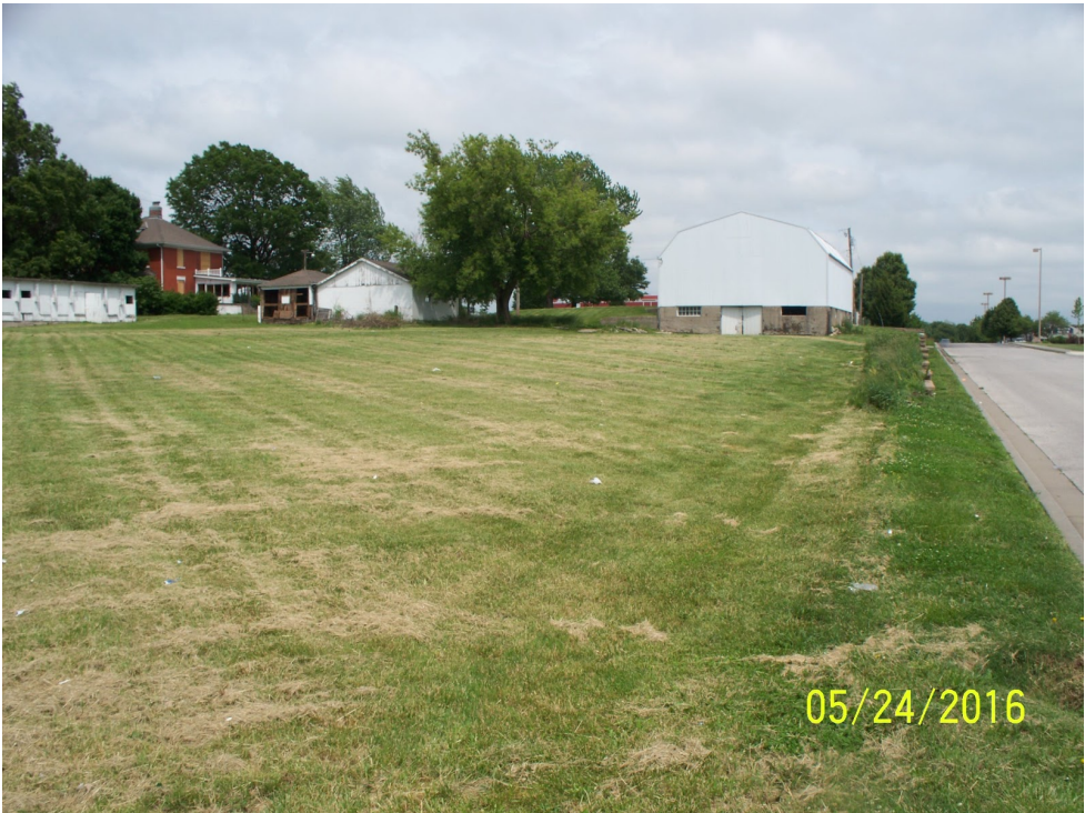
View from Dean Avenue looking northeast