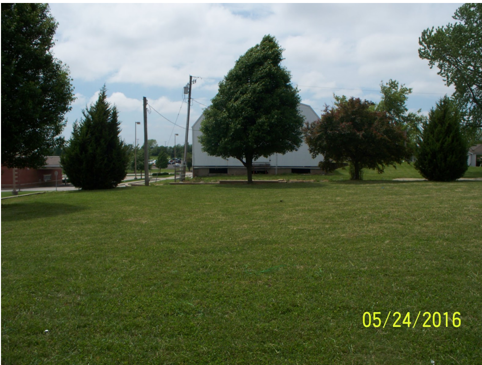
View from Golden Corral looking west at site