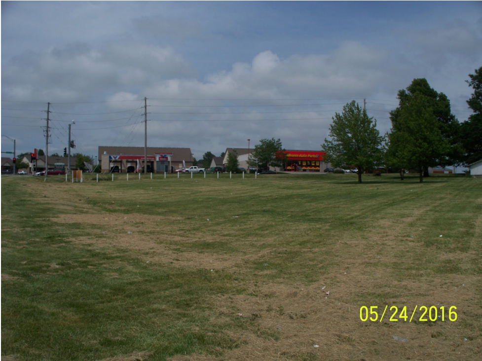
View from Dean Avenue looking north