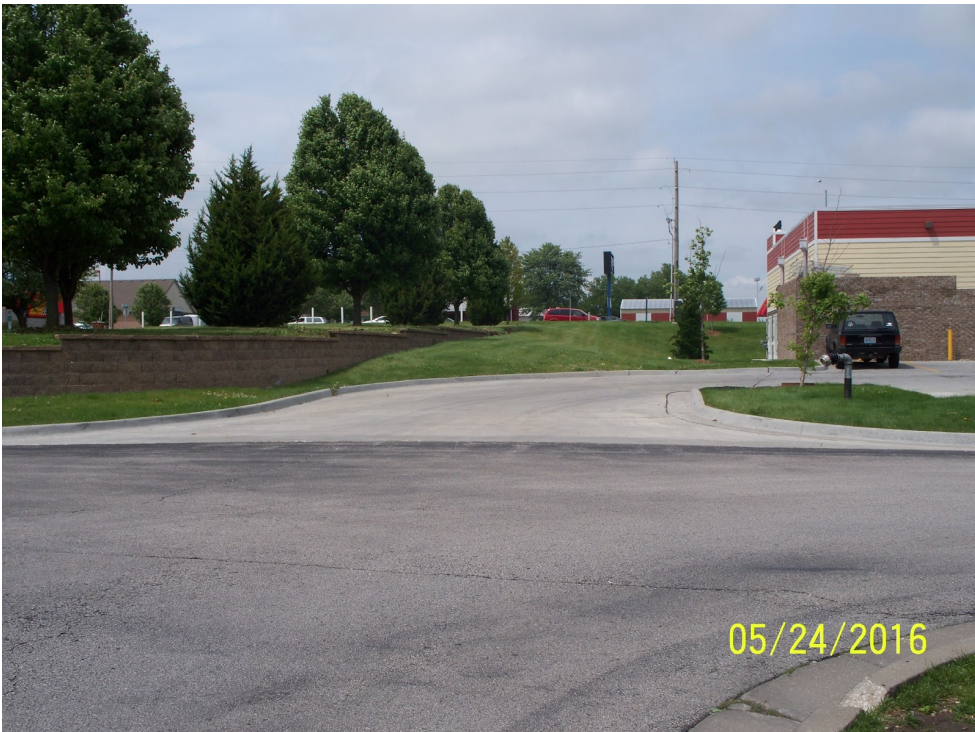
View looking north at where 2nd access point will be shared with Golden Corral