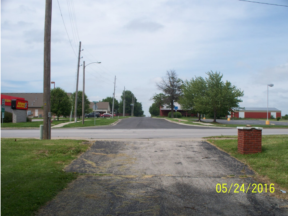
View looking north at where access drive to site will match up with Kentucky Road