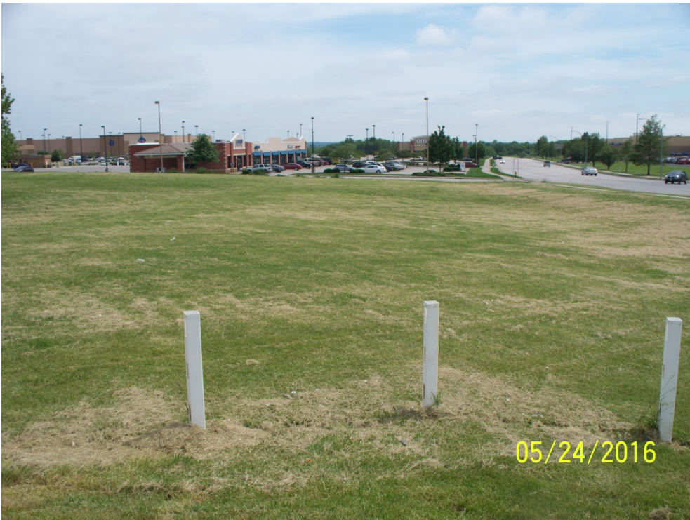
View from Dean Avenue & 58 Highway intersection looking south