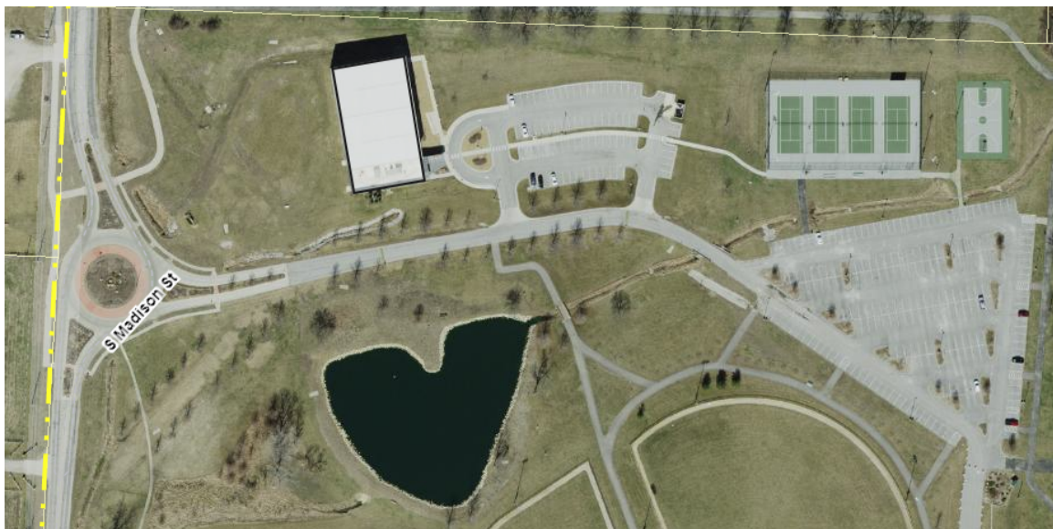
Map 1. Raymore Activity Center

Activities- The Raymore Activity Center is an athletic and event space that does not contribute any significant stormwater impacts or concerns.