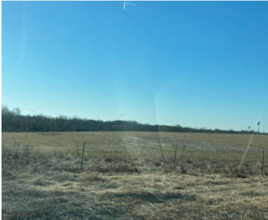
View looking south from Hubach Hill Rd. (From Northeast corner of Sendera Subdivision)