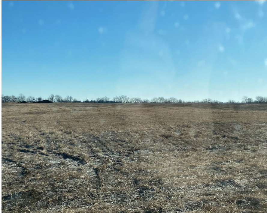
View looking east from existing “Prairie of the Good Ranch” Subdivision (along Brook Pkwy)

Existing Zoning: “PUD” Planned Unit Development Existing Surrounding Zoning: North: Unincorporated Cass County and “R-1P” (Single-Family Planned Residential) South: “A” Agriculture and Unincorporated Cass County East: Unincorporated Cass County West: “R-1P” Single-Family Planned Residential District Existing Surrounding Uses: North: Single Family Residential, Cass County South: Agriculture East: Undeveloped, Cass County West: Single-Family Residential