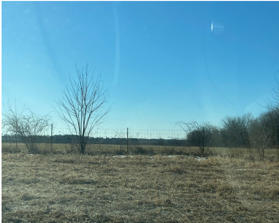
View looking south from Hubach Hill Rd (From northwest corner of Sendera Subdivision)